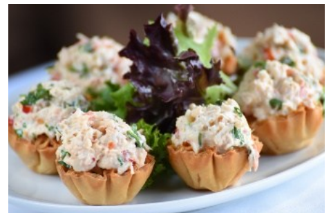
Crab, Chili & Lime Filo Tarts