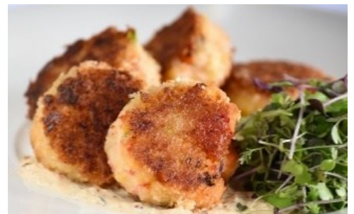
Lobster Crab Cakes